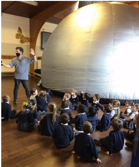
Receptions were extremely excited about their visit into the wonder dome this morning.