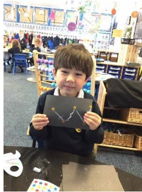
Afterwards, we went on a constellation hunt in the classroom using torches and then made some of our very own constellations.