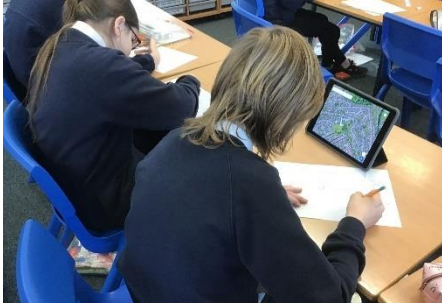
Year 6 have been getting to grips with computer mapping in order to create their own maps.