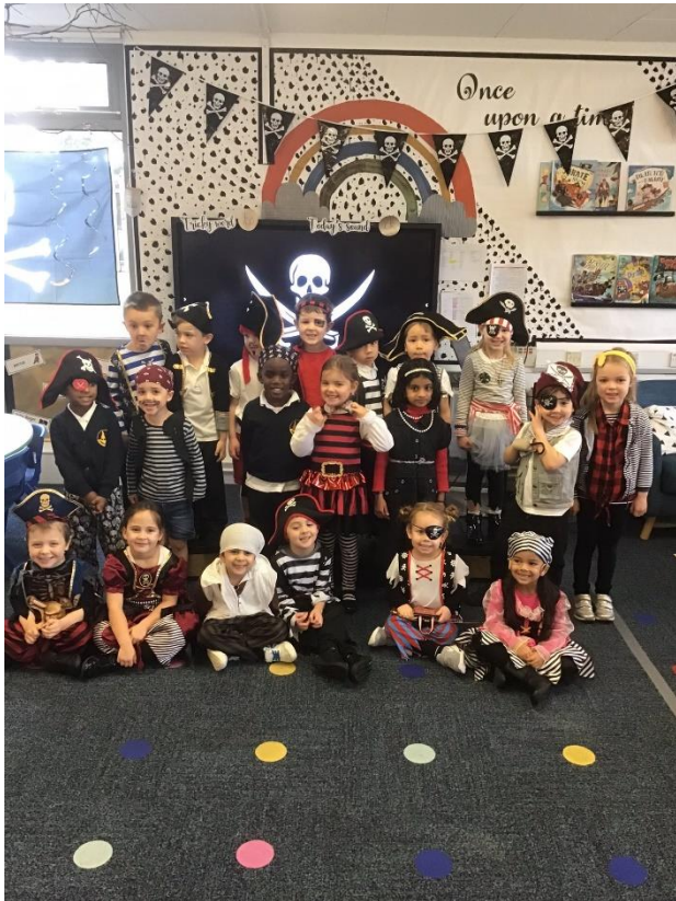
Reception had a fantastic Pirate day! Ahoy there, Mateys!