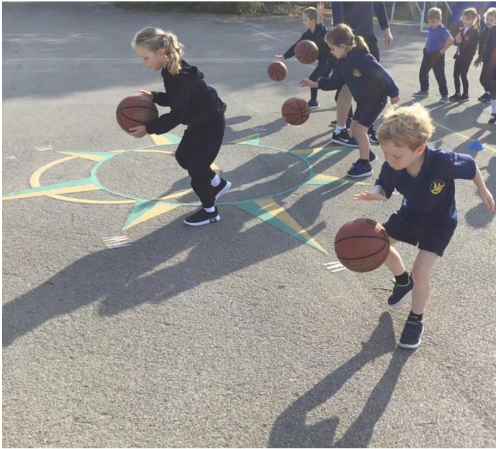
Some of our activities from National Fitness Day!