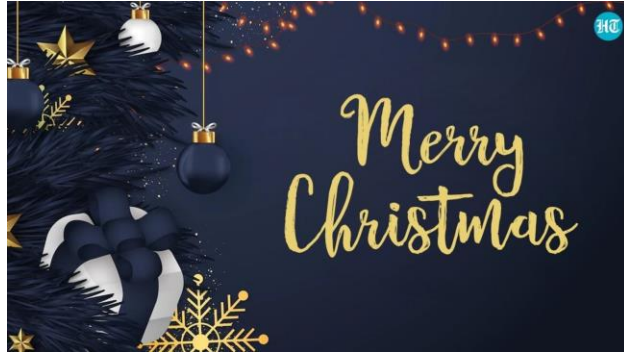
1 - Merry Christmas from Parklands!