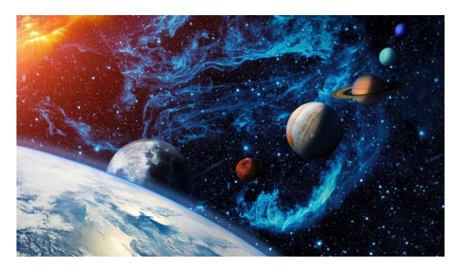
YEAR 5 - Space and Earth

Our exploration begins next week by unraveling the mystery of South America's precise location and its diverse features. We will uncover the remarkable rainforests and transform ourselves into rainforest experts! Our quest will include a look at the rainforest biome, comprehending the intricate workings and importance of the rainforest water cycle, and exploring the devastating consequences of deforestation.